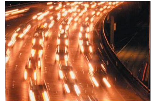
•Traffic control system