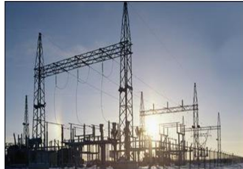
•The power system