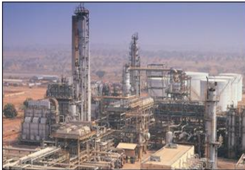
Industrial automation system